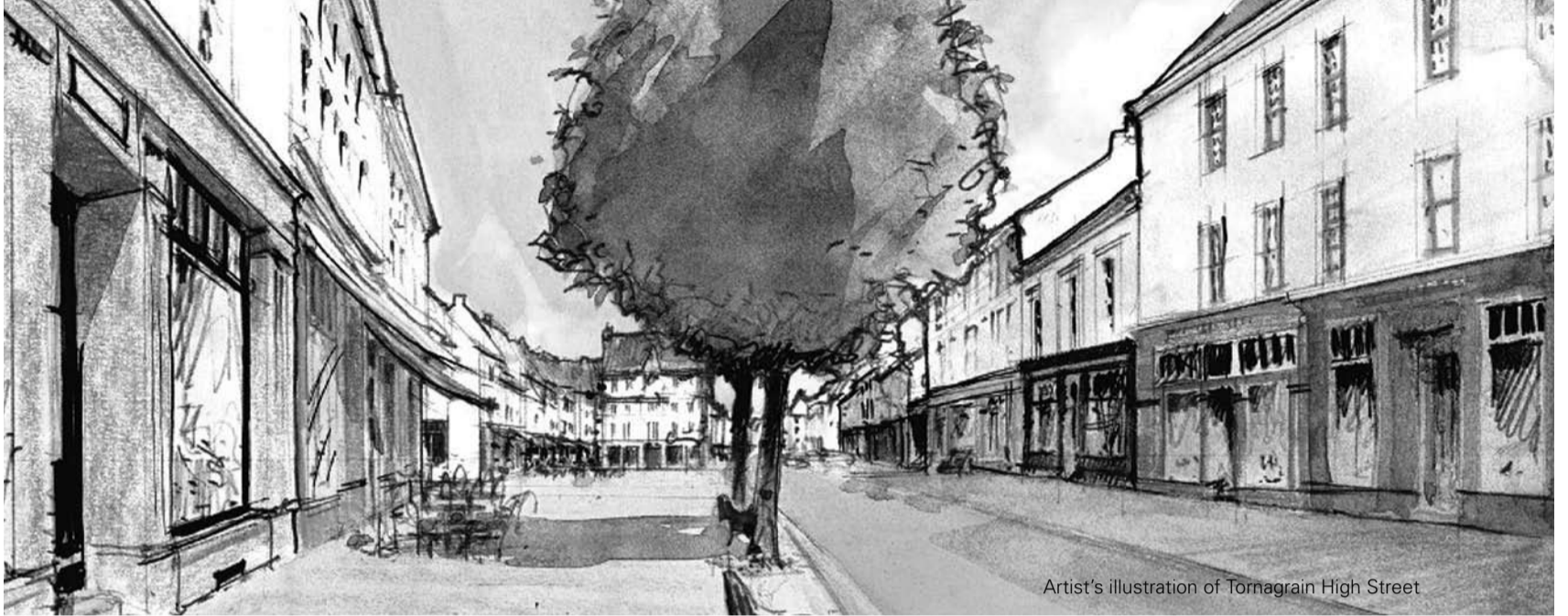
Artist's illustration of Tornagrain High Street

between 12 noon and 9pm (Wednesday) 10am and 9pm (Thursday) at Petty Church Hall, off the A96 by Tornagrain